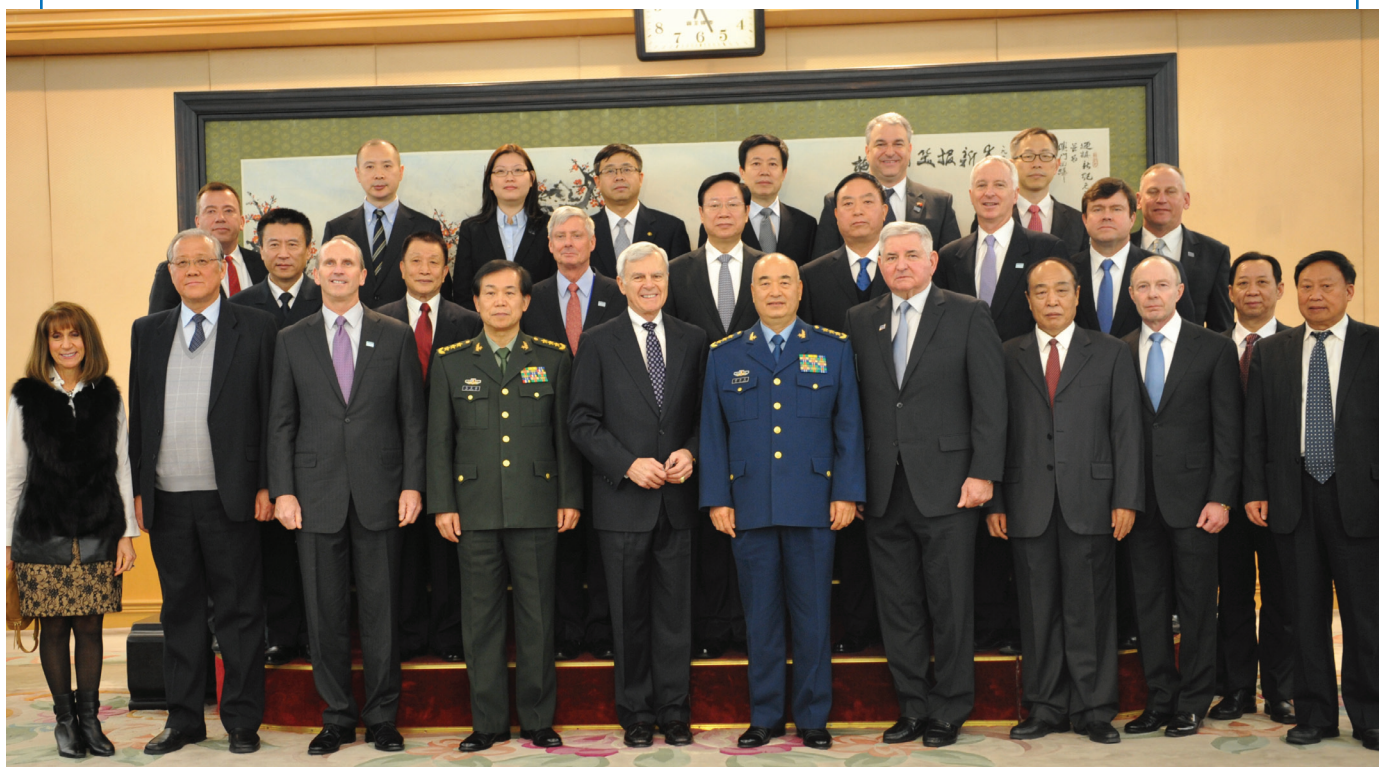
U.S. and Chinese delegations meet with Vice Chairman Xu Qiliang of China's Central Military Commission.

T he EastWest Institute (EWI), in partnership with the China Association for International Friendly Contact (CAIFC), convened the sixth meeting of the U.S.-China Sanya Initiative from December 4 to 7, 2015. Senior retired flag officers of the U.S. Army, Navy and Air Force traveled to Beijing, China to meet with retired flag officers of the Chinese People's Liberation Army (PLA) to discuss critical issues in the U.S.-China military-to-military relationship. The delegations spent one-and-a-half days in off-the-record dialogue and also met with sitting members of China's Central Military Commission.