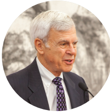
Admiral (Ret.) William A. Owens Former Vice Chairman, Joint Chiefs of Staff