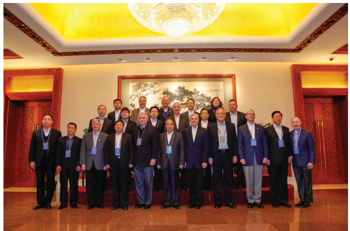
U.S. and Chinese delegations pose together at the Diaoyutai State Guesthouse.