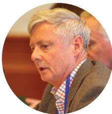
General (Ret.) Walter L. Sharp Former Commander, United Nations Command; Former Commander, Republic of Korea-United States Combined Forces Command; Former Commander, United States Forces Korea