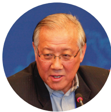
General (Ret.) Li Andong Former Deputy Chief, General Equipment Department, People's Liberation Army