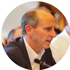
Admiral (Ret.) Jonathan W. Greenert Former Chief of Naval Operations, United States Navy