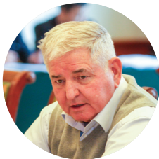
General (Ret.) Ronald R. Fogleman Former Chief of Staff, United States Air Force