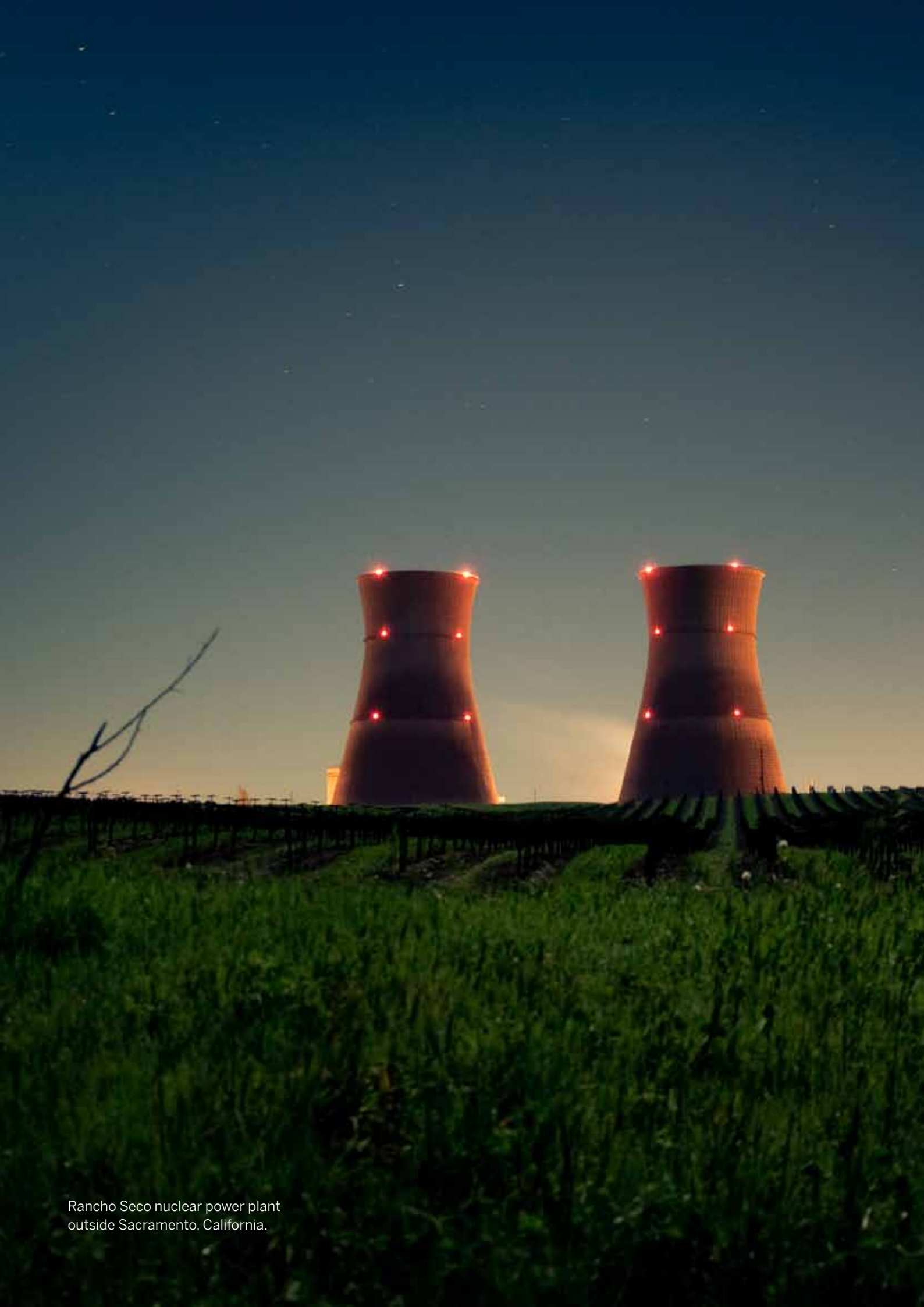
Rancho Seco nuclear power plant outside Sacramento, California.