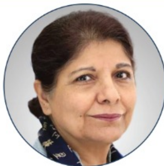
Dr. Shamshad Akhtar

Chairperson, Karandaz & Former Federal Minister for Finance & Governor, SBP