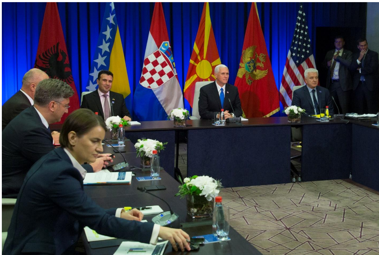
Vice President Pence and regional leaders at the Adriatic Charter Summit during his August 2017 trip to the Western Balkans.