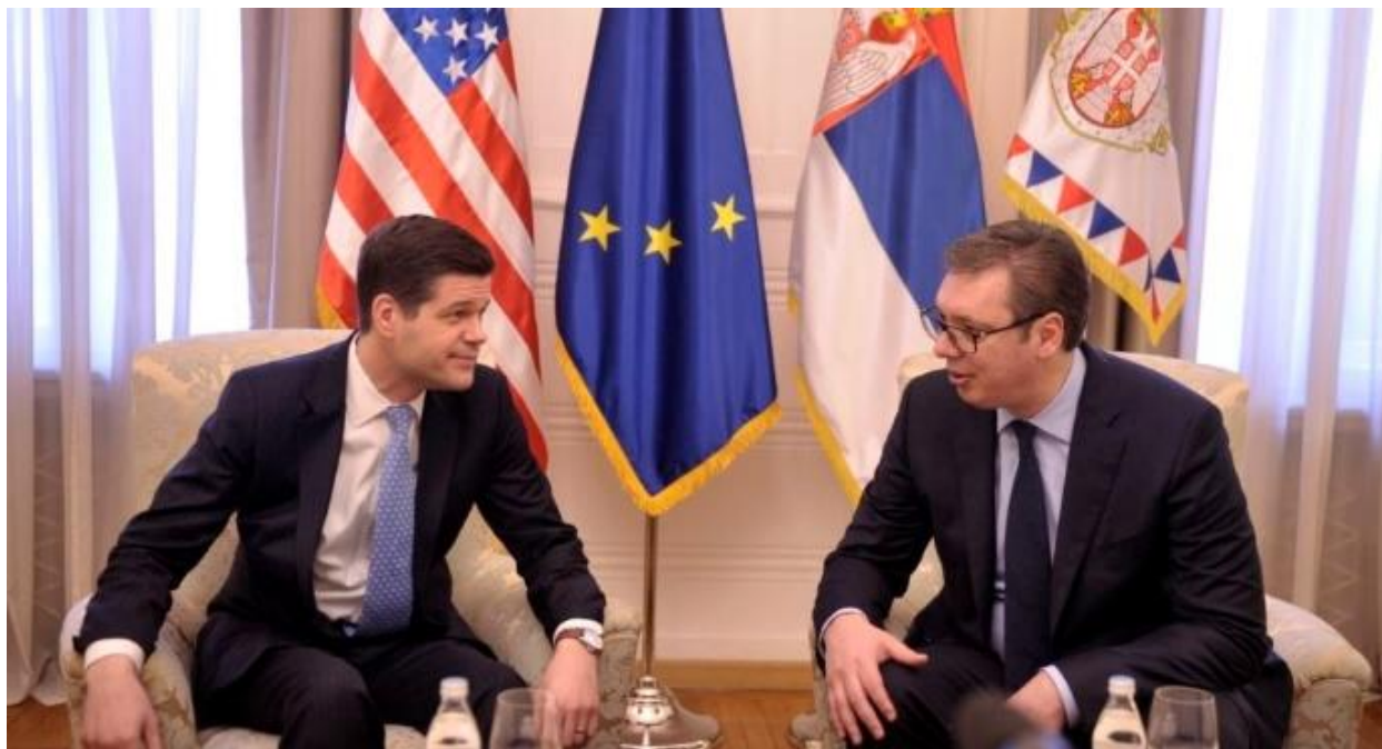
Assistant Secretary of State A. Wess Mitchell and Serbian President Aleksandar Vucic meet in Belgrade in March 2018