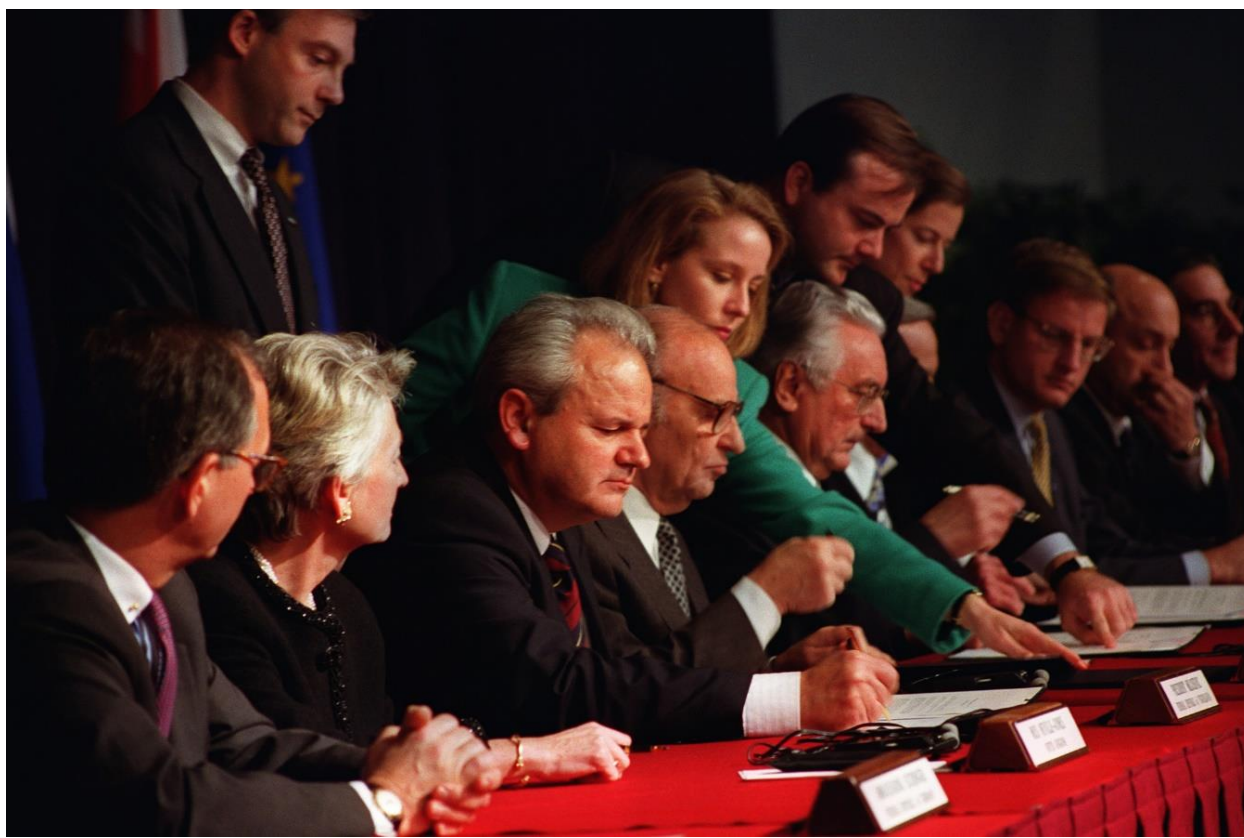
President Slobodan Milošević of the Federal Republic of Yugoslavia, President Alija Izetbegović of the Republic of Bosnia and Herzegovina, and President Franjo Tuđman of the Republic of Croatia initial the Dayton Peace Accords in December 1995.