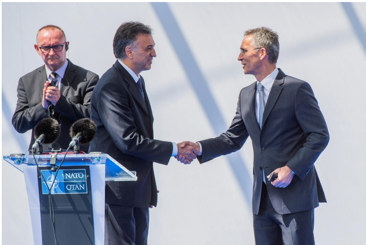
President Filip Vujanović of Montenegro greets NATO Secretary General Jens Stoltenberg at the flag-raising ceremony marking the accession of Montenegro to NATO.

The development of a Kosovar defensive force will not, in the near term, enable the United States and its European allies to reduce their direct military commitment to Kosovo. Until Serbia and Kosovo enjoy a stable relationship, NATO, including U.S. forces, needs to be present. That said, the NATO presence in Kosovo is temporary by definition. It should remain so, and Washington and NATO should reject recent calls for a permanent U.S. or NATO military presence in Kosovo or elsewhere in the Balkans, which would needlessly provoke Russia and Serbia.