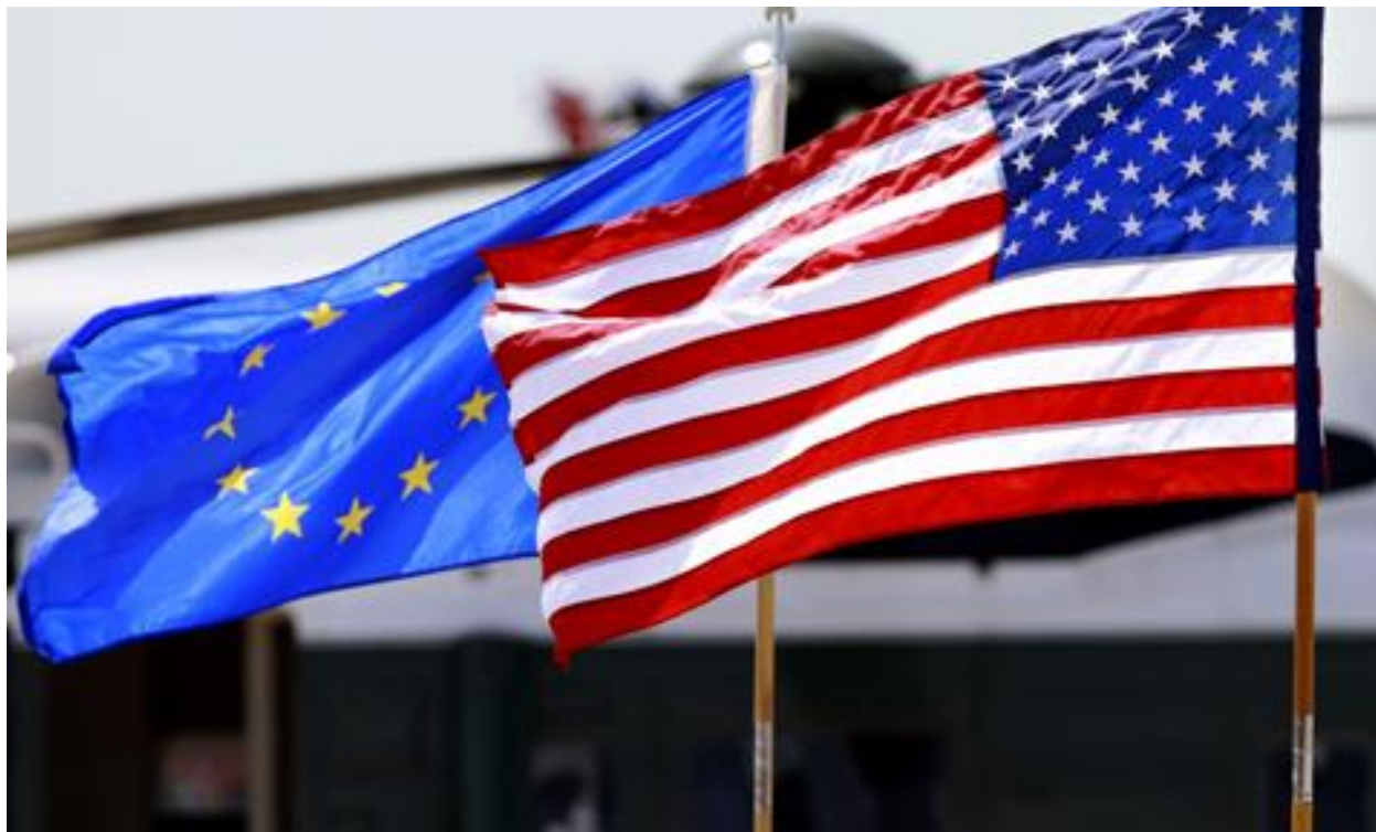
The flags of the United States and the European Union flying in Brussels, Belgium.

the Western Balkans. In recent years, Germany has been a driver of Balkan policy. Now that Chancellor Merkel has formed a governing coalition, the U.S. should encourage the Chancellor to retake her active role. France’s President Macron has recently expressed renewed commitment to the Western Balkans, and France, too, may be able to play a leading role. Further, Bulgaria has taken a leading role in promoting the E.U. integration of the Balkans through its focus on the region at the upcoming Sofia summit in May.