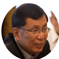
Lieutenant General (Ret.) Chen Xiaogong Former Deputy Commander, People's Liberation Army Air Force