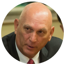
General (Ret.) Raymond T. Odierno Former Chief of Staff, United States Army; Former Commander, United States Joint Forces Command