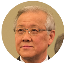
General (Ret.) Li Andong Former Deputy Chief, General Equipment Department, People's Liberation Army