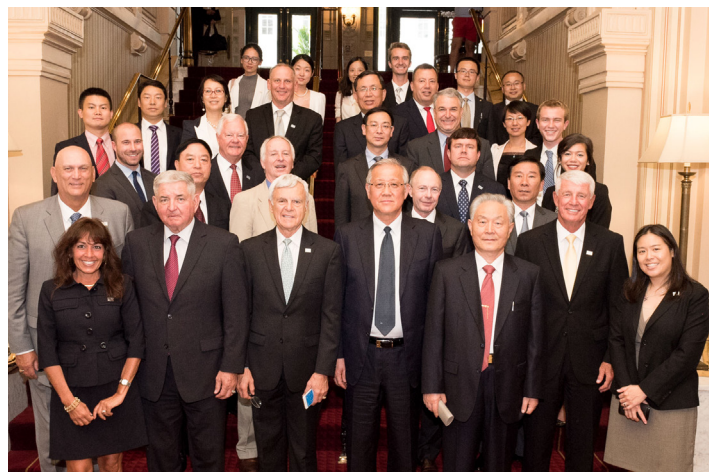
U.S. and Chinese delegates and staff in Washington, D.C.