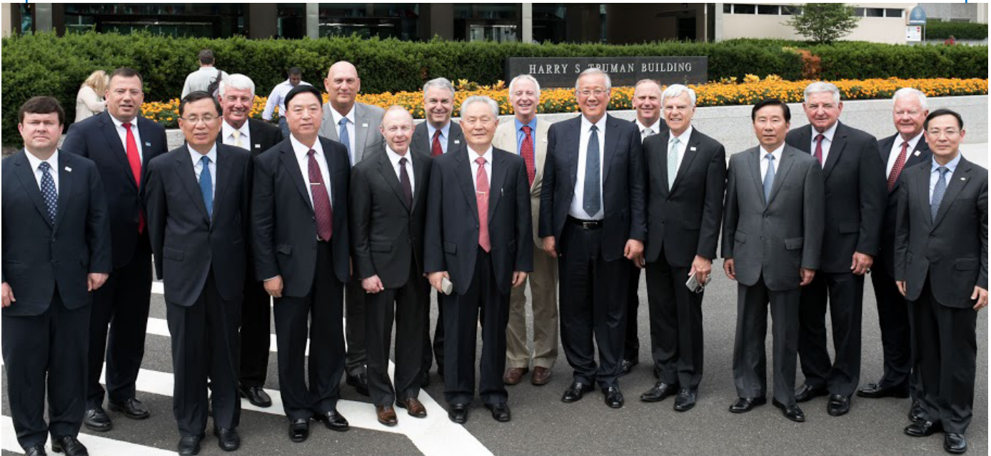
U.S. and Chinese delegates outside of the U.S. Department of State in Washington, D.C.

T he EastWest Institute (EWI), in partnership with the China Association for International Friendly Contact (CAIFC), convened the seventh meeting of the U.S.-China Sanya Initiative from July 6 to 9, 2016. Senior retired flag officers of the U.S. Army, Navy and Air Force met with retired flag officers of the Chinese People's Liberation Army (PLA) in Washington, D.C. and New York City to discuss critical issues in the U.S.-China military-to-military relationship. The meeting occurred against the backdrop of an impending arbitral decision on the China-Philippines dispute over territorial claims in the South China Sea and a fractious U.S. presidential election campaign. While in Washington, D.C., the delegations met with Senators John McCain (R-AZ) and Tom Cotton (R-AR) from the U.S. Senate Committee on Armed Services, Congressman Rick Larsen (D-WA) of the U.S.-China Working Group and Assistant Secretary of State Daniel Russel. In New York, the delegations spent two days in off-the-record dialogue and also met with C.V. Starr & Co., Inc. Chairman and CEO Maurice Greenberg.