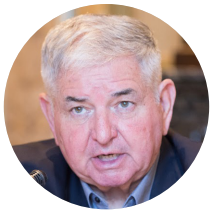
General (Ret.) Ronald R. Fogleman Former Chief of Staff, United States Air Force