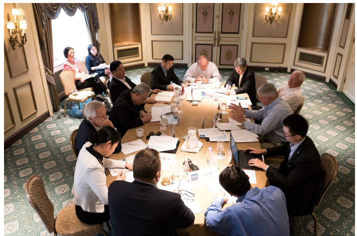
A breakout group discussion in New York on regional security issues.