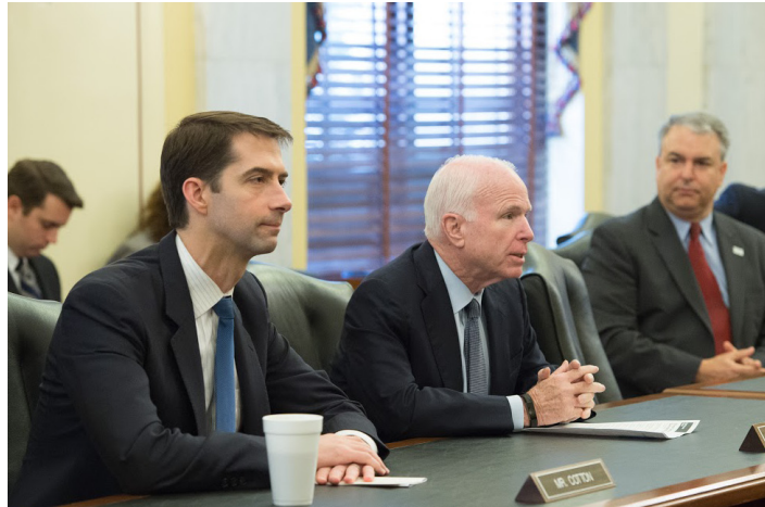
Senators Tom Cotton and John McCain address U.S. and Chinese delegates.