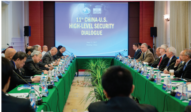
Dialogue session at the China Institute of International Studies (CIIS).