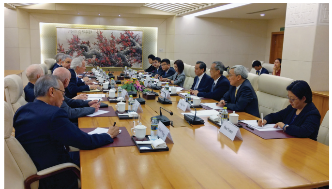
Meeting with Foreign Minister Wang Yi at the Ministry of Foreign Affairs of the People's Republic of China.