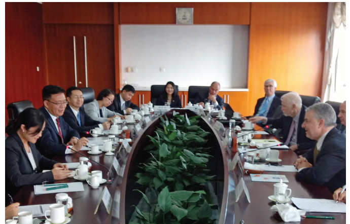
Meeting with Vice Minister Guo Yezhou at the International Department of the Central Committee of the Communist Party of China.