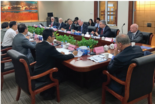
Dialogue session at the China Reform Forum.