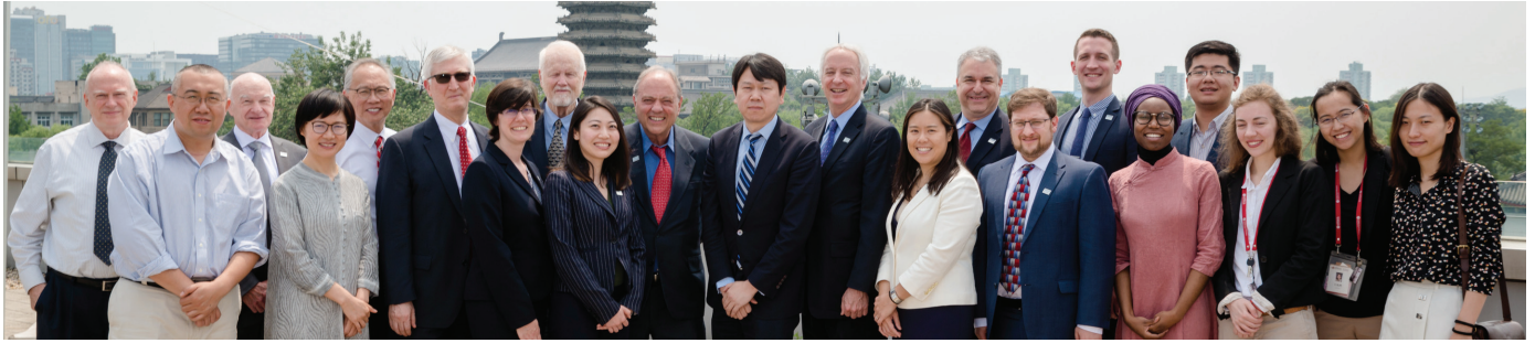
Group photo at the Guanghua School of Management at Peking University.