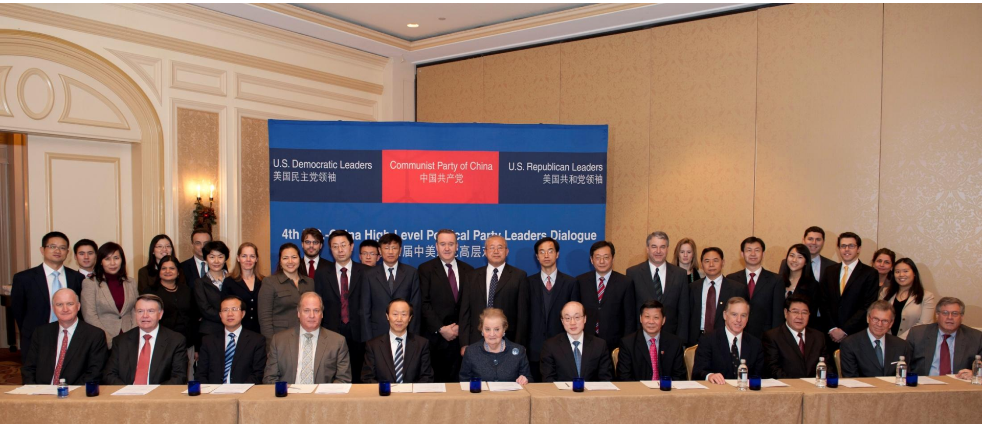
4 th U.S.-China High-Level Political Party Leaders Dialogue December 4-10, 2011