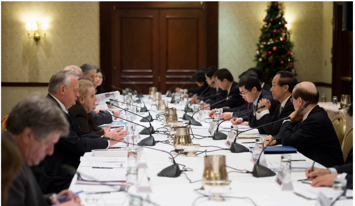
CPC delegates meet with prominent Democrats and Republicans in Washington, D.C.

The key discussions during this fifth iteration of the dialogue focused on recent trends in U.S. and Chinese politics, the economy and domestic governance in both countries and the development of U.S.-China relations under China's new leadership and President Barack Obama's second term. The CPC delegation also met with a number of U.S. private sector leaders.