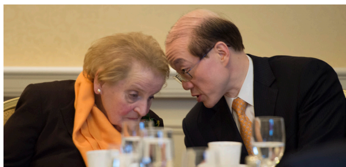
Clockwise, from top-left: Madeleine Albright and Wang Jiarui; Joseph Lieberman, Wang Jiarui and Benjamin Cardin; Gary Herbert (center) with the principal Chinese delegates; Madeleine Albright and Liu Jieyi; Wang Jiarui and Michael C. Gould